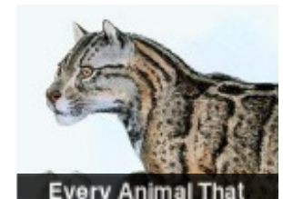
Every Animal That