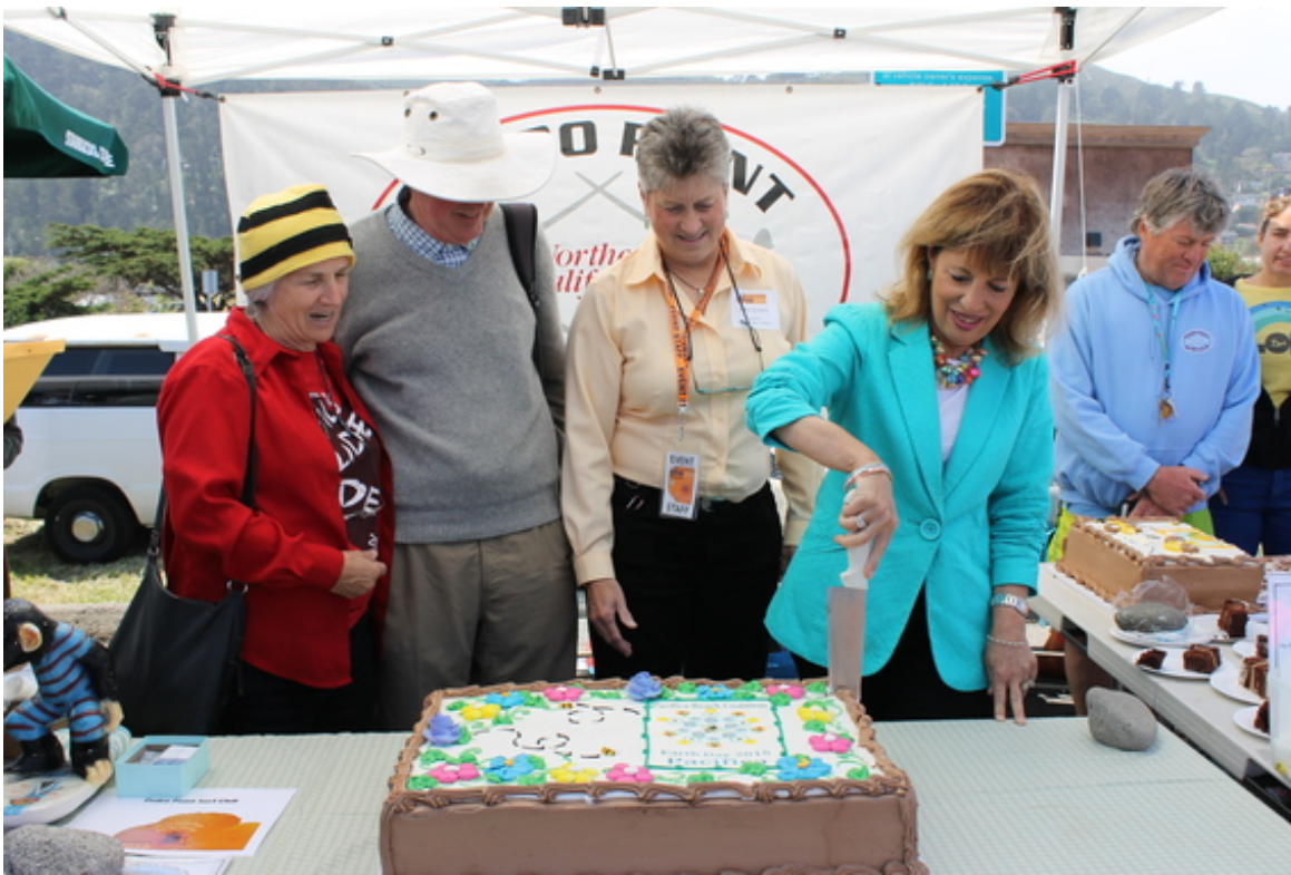
I celebrated the 45th Earth Day with the Pacifica Beach Coalition, a group that collects trash and restores habitat.

Forty-five years ago, rivers were on fire because of industrial pollution. Today our entire planet is on fire because of carbon pollution. 2014 was the hottest year on record. Temperatures over land and ocean surfaces were the highest since scientists started recording them in 1880. Strange weather has made headlines around the world. We've seen polar vortices and tornadoes in the Midwest, massive snowstorms on the East Coast, rapidly shrinking sea ice at the North and South poles, record hurricanes and cyclones over the Pacific and Indian Oceans, flooding in Asia, and extreme droughts in Africa and right here in the western states of the U.S. Scientists call this the "new normal" -- in a warming world we have to expect the unexpected.