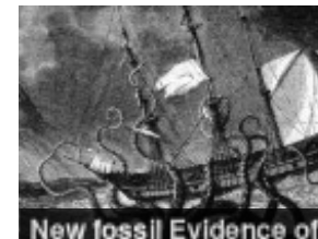
New fossil Evidence of